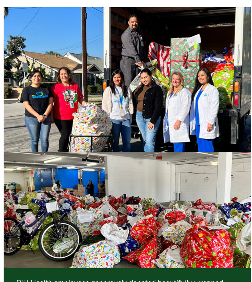
PIH Health employees generously donated beautifully wrapped gifts to fulfill the holiday wish lists of 219 families in need served by The Whole Child.

Each year our Pediatrics department partners with Reach Out and Read to distribute more than 4,742 new books to patients to promote literacy and school readiness.